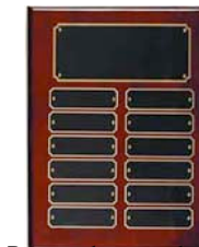
Rosewood perpetual plaque includes twelve name plates.

The Perpetual plaque is designed for providing public recognition to exemplary employees with an ongoing recognition program. It can be added onto any of the above levels for an additional $174.95. This includes the engraved plaque in your company's name with name plates for future awardees. Each time you wish to recognize an employee (of the month, quarter, or year) just order a Bronze, Silver or Gold plaque and Award Letter. (Note upon ordering initial plaque, additional name plates will be included for additional awardees.)