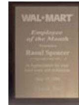
Cherry finished plaque with bronze mirrored plate

The Bronze level will honor the dedicated service of an employee with a plaque made of cherry finish with a bronze mirrored plate. The plaque comes personalized with an accompanying letter of recognition, handsomely displayed in a presentation folder. Make this recognition lasting by adding the perpetual plaque for an additional $174.95!