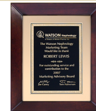
Cherry finish frame plaque with black & gold florentine plate on brushed metal gold background

The Gold level is designed to honor the exemplary service of an employee with a plaque made of cherry finish frame plaque with black and gold florentine plate on brushed metal gold background. The plaque comes personalized with an accompanying letter of recognition, handsomely displayed in a presentation folder. make the recognition ongoing by adding the perpetual plaque for an additional $174.95!